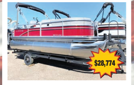
2023 UC 180

RV & MARINE PARTS & SERVICE FREE CONSIGNMENT ON-SITE APPRAISALS FINANCING AVAILABLE TRADE-INS ACCEPTED