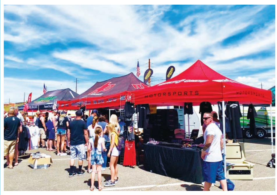
Shop for boating accessories at the 33rd Annual Lake Havasu Boat Show.