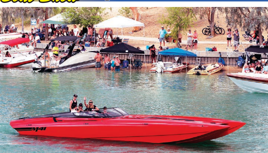
The Bridgewater Channel is where boaters often park to be seen and soak-in the party atmosphere.