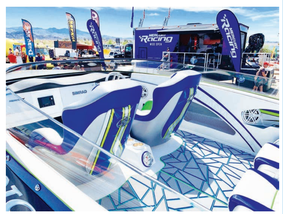
See eye-catching colors at the Boat Show.

For more stories on Lake Havasu Boat Show, turn to Entertainment later in this section.