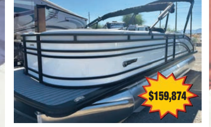
2024 HARRIS SOLSTICE 250 SLEC