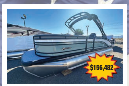
2024 HARRIS SOLSTICE 230 SLDH