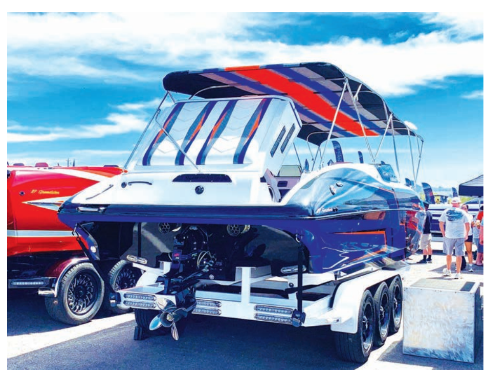
Find all colors, sizes, and brands of boats at the Boat Show.