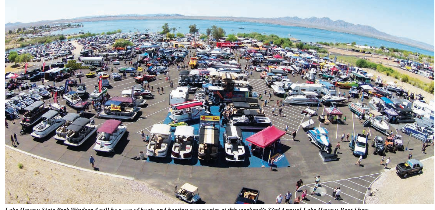
Lake Havasu State Park Windsor 4 will be a sea of boats and boating accessories at this weekend's 33rd Annual Lake Havasu Boat Show.