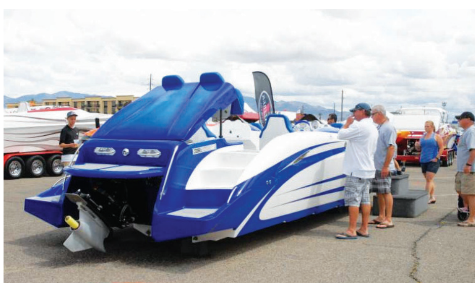
Walk around and see boats up-close at this weekend's Lake Havasu Boat Show, April 19-21, at Lake Havasu State Park, Windsor 4.